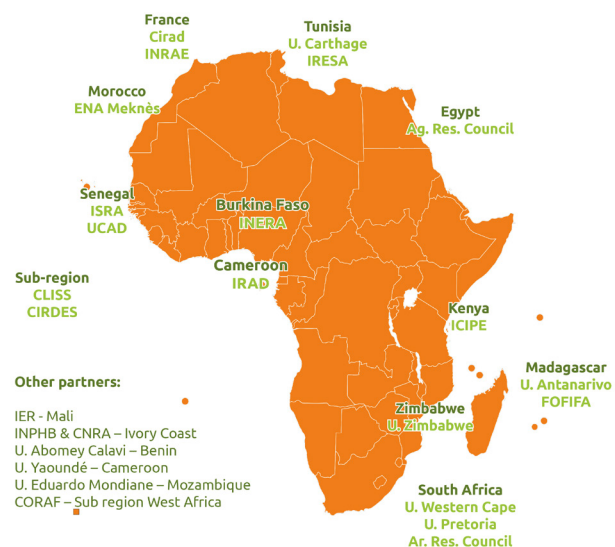
Map of partners, countries and member institutions

TSARA will help advance international initiatives like the European Union-African Union (EU-AU) Research and Innovation Partnership and in particular the resulting International Research Consortium (IRC FNSSA), EU-AU Plant Protein Initiative, Great Green Wall Accelerator, PREZODE (Prevention of Zoonotic Disease Emergence) and the 4 per 1000 initiative (Soils for Food Security and Climate).