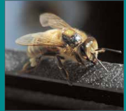
RFID microchip glued to a bee's thorax.

For the first time, a French multi-partner research team observed the effects of a low dose of insecticide on bees. By disrupting their orientation performance and ability to find the hive, this can ultimately lead to the decline of their colony.