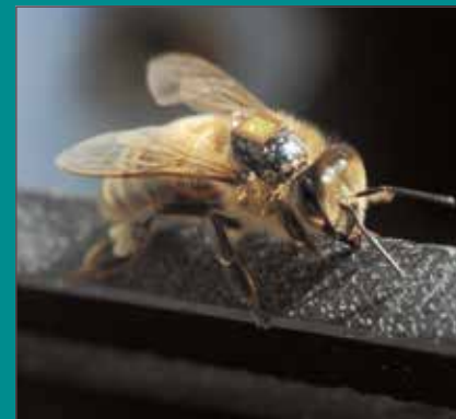
RFID microchip glued to a bee's thorax.

For the first time, a French multi-partner research team observed the effects of a low dose of insecticide on bees. By disrupting their orientation performance and ability to find the hive, this can ultimately lead to the decline of their colony.