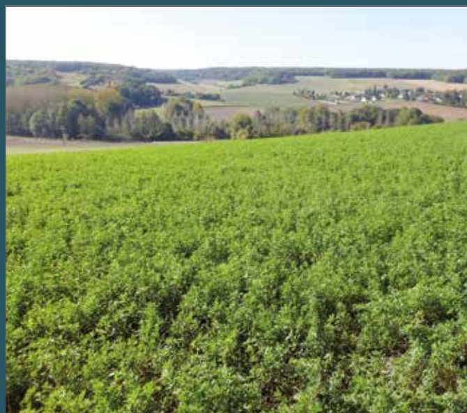
Alfalfa cultivation in France.

The project will focus on seven forage crops and seven grain crops that are currently grown to produce feed (for ruminants – cattle, sheep, goats and monogastric animals – pigs, poultry), food (as is or after processing) or to deliver ecosystem services.