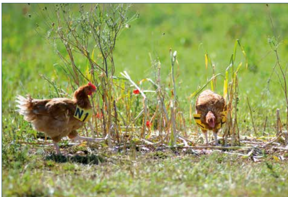
▲ The Alteravi poultry farming platform, with access to an outdoor run, is certified organic.